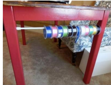
Ribbon storage is another great tension rod hack for the craft room.

http://www.wimp.com/tension-rod-home-hacks-besides-curtains/?utm_source=facebook.com&utm_medium=social&utm_campaign=story/