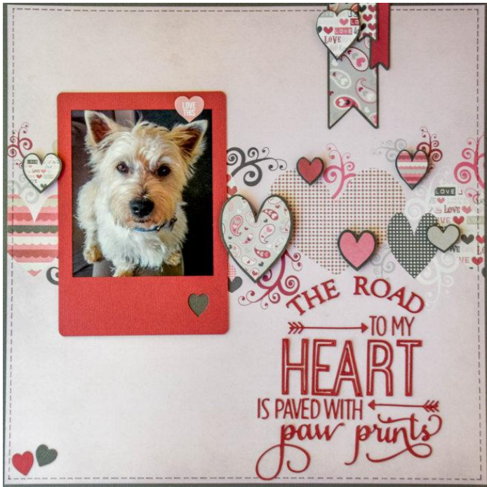
GrannyEnchanted.com from Pinterest

"Our perfect companions never have fewer than four feet." — Colette