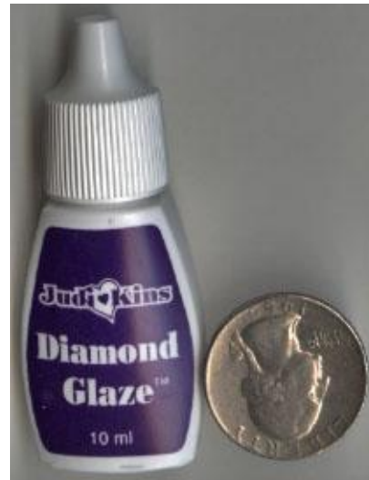
SNC price $2